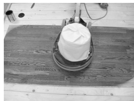
6: Equalize the surface. Residues in beveled edges have to be equalized by hand in some cases.

After drying overnight repeat the procedure