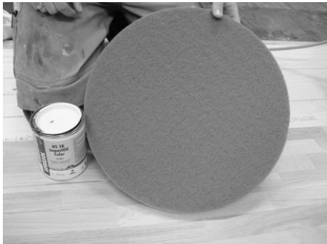
1: LOBASAND Spezial Pad beige