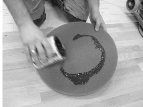
2: Put LOBASOL® HS 2K ImpactOil Color directly on a LOBASAND Spezial Pad beige