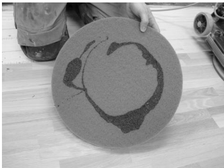
3: LOBASAND Spezial Pad beige, soaked with LOBASOL® HS 2K ImpactOil Color