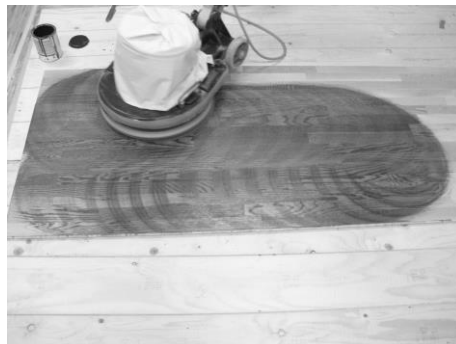
4: Apply oil with the pad in an evenly thin layer by using a single-disc machine